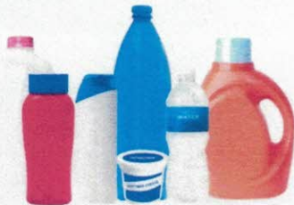
Plastic Bottles, Jugs, Tub, & Lids (Empty kitchen, laundry, & bath containers)