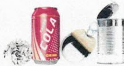
Aluminum & Steel Cans (Foil & empty food & beverage cans)